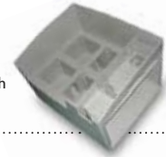
Box for electrical switch

“ We used to have to choose between the low strength and indentation resistance of standard W Nr 1.2738/P20 or the low machinability of W Nr 1.2738/P20 High Hard. Now when using Uddeholm Nimax we can offer our customers a steel with good indentation resistance and we, as a tool maker, can benefit from the good machinability. ” STEMA S.r.l, Italian tool maker