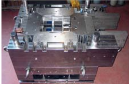
Uddeholm Nimax tool for producing a box for electrical switches.

“ We used to have to choose between the low strength and indentation resistance of standard W Nr 1.2738/P20 or the low machinability of W Nr 1.2738/P20 High Hard. Now when using Uddeholm Nimax we can offer our customers a steel with good indentation resistance and we, as a tool maker, can benefit from the good machinability. ” STEMA S.r.l, Italian tool maker